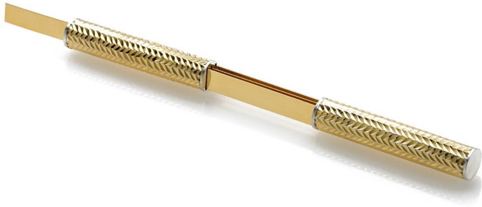
Read between the lines, necklace sterling silver 370(670) × 8 × 8 mm